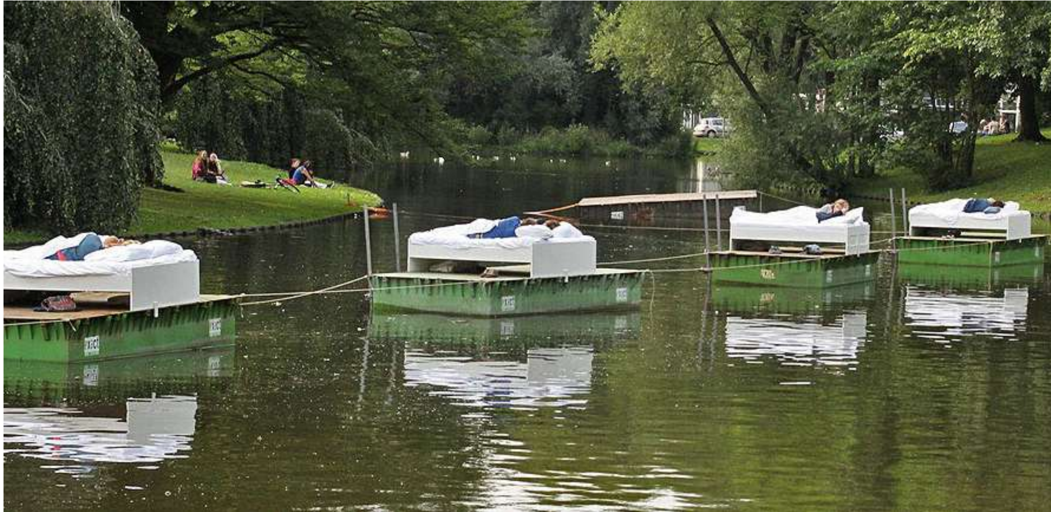
Noorderzon Performing Arts Festival, Groningen, Holanda