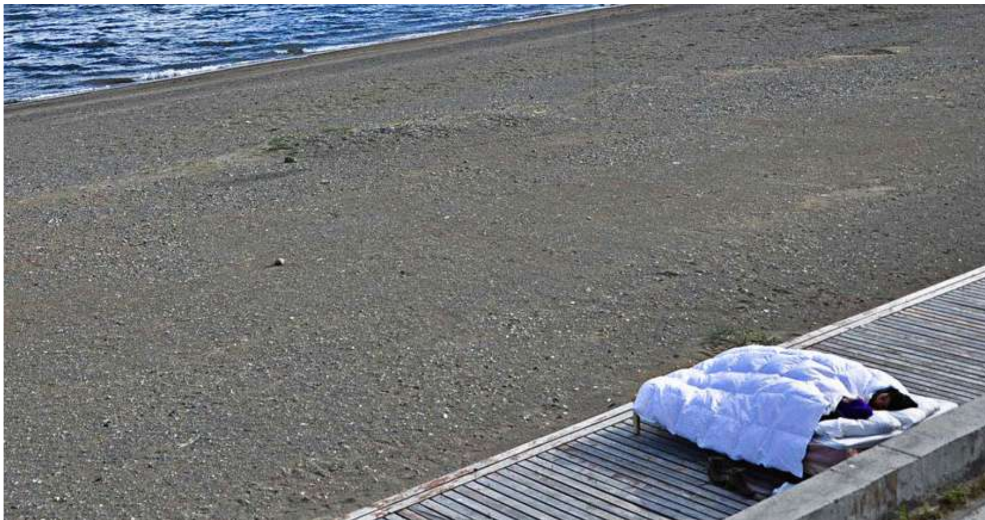
Festival Cielos Del Infinito, Punta Arenas, Chile