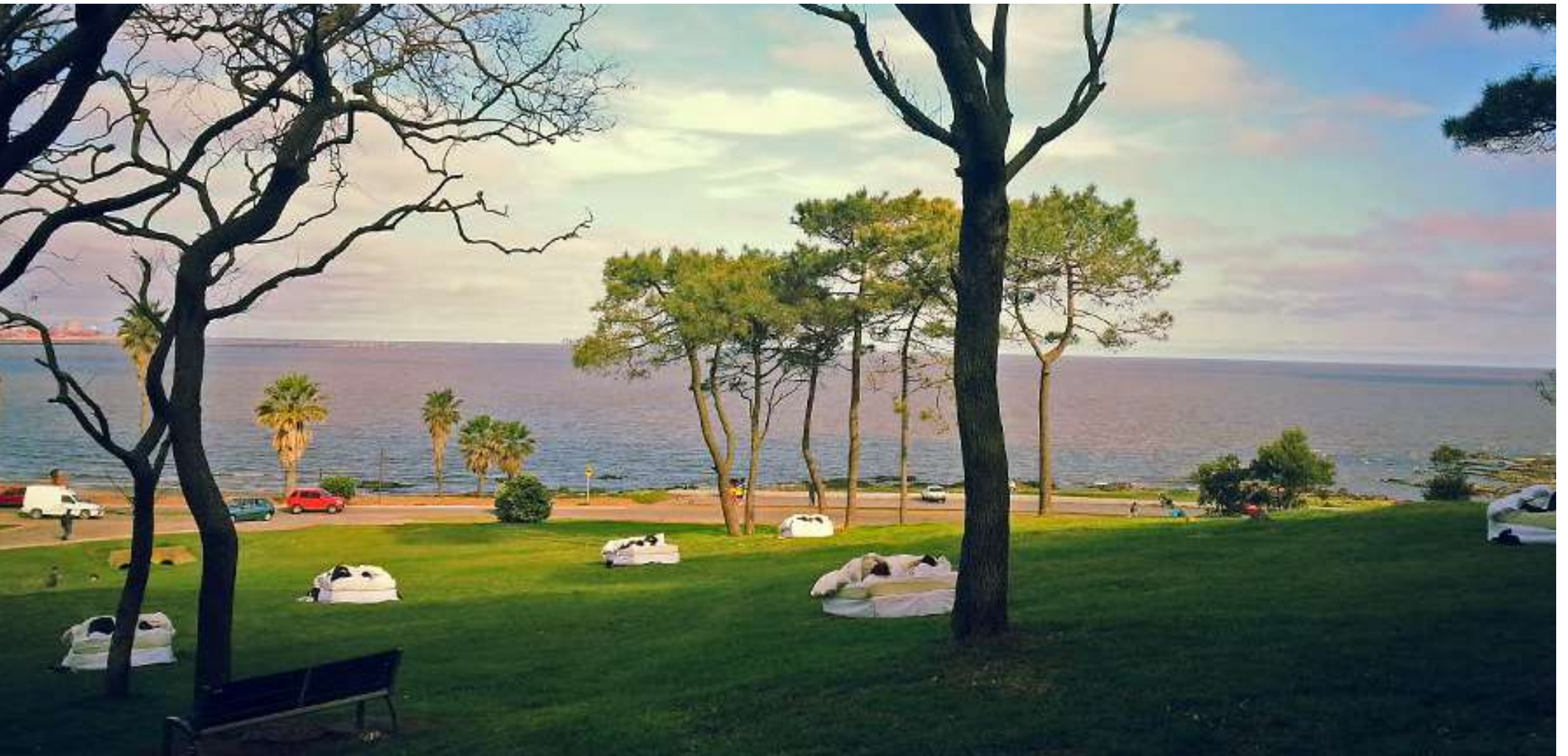
Fidae Festival Internacional De Artes Escénicas. Montevideo, Uruguay