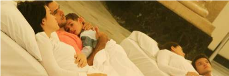
Festival Cena Brasil Internacional, Rio De Janeiro, Brasil