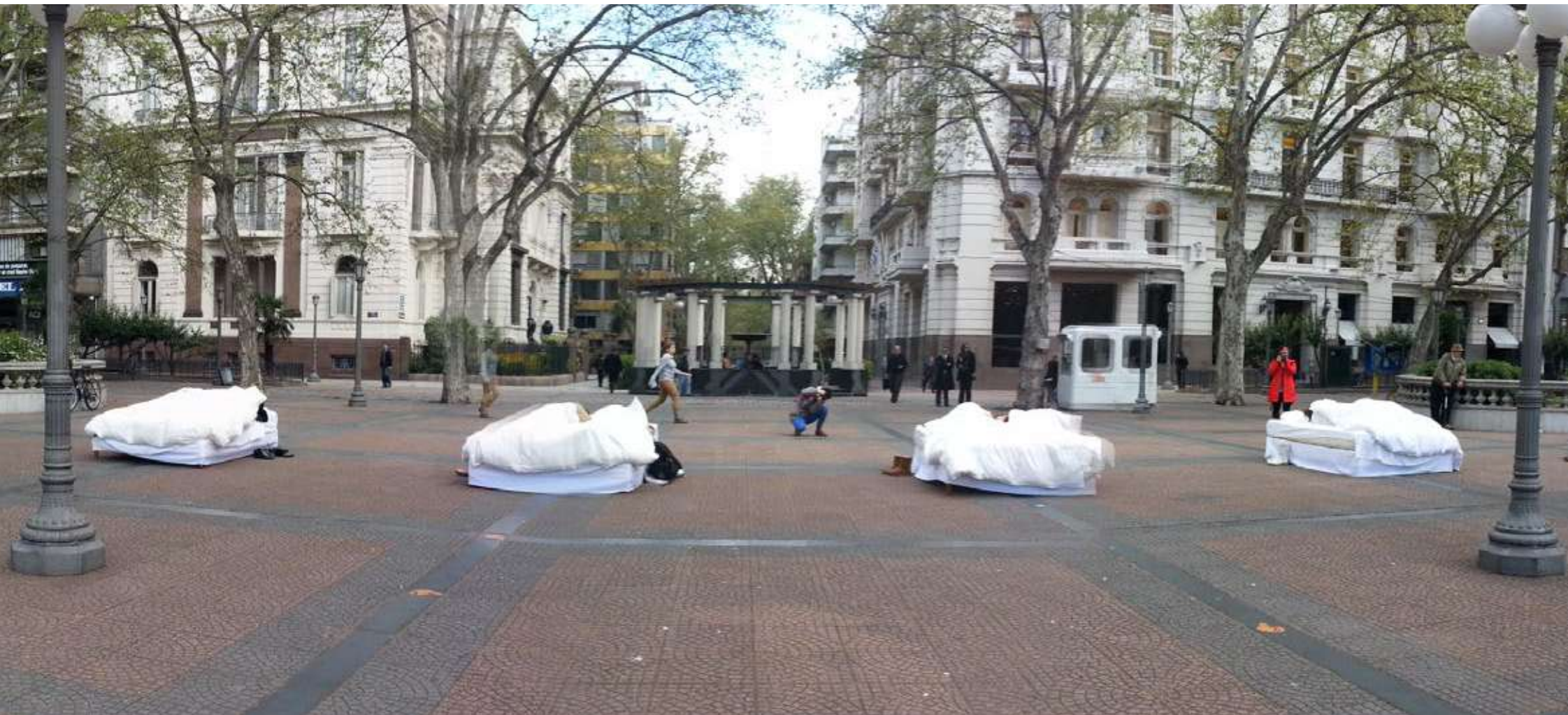
Fidae Festival Internacional De Artes Escénicas. Montevideo, Uruguay