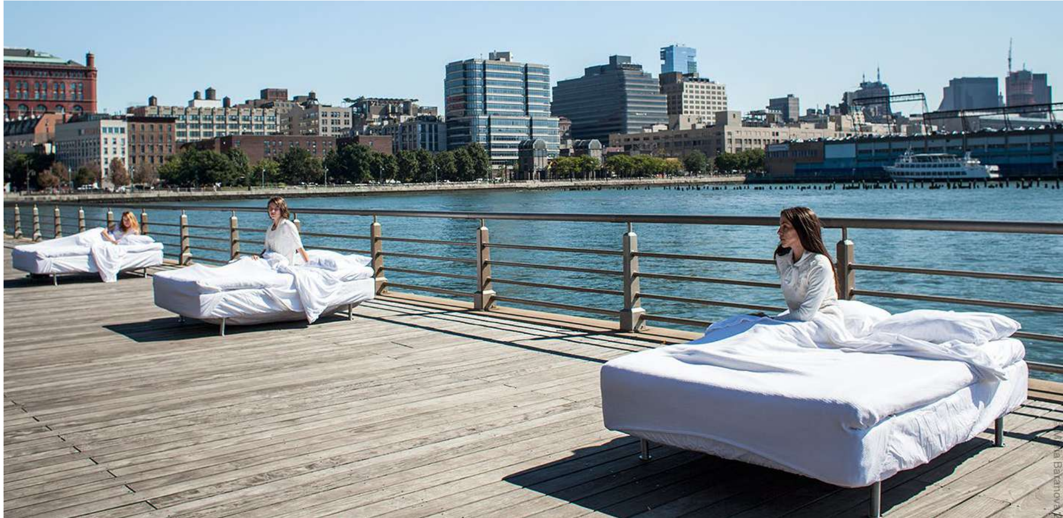
Crossing The Line Festival, New York, United States