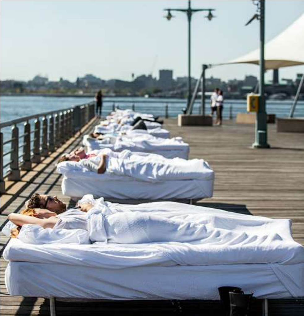
Crossing The Line Festival, New York, United States