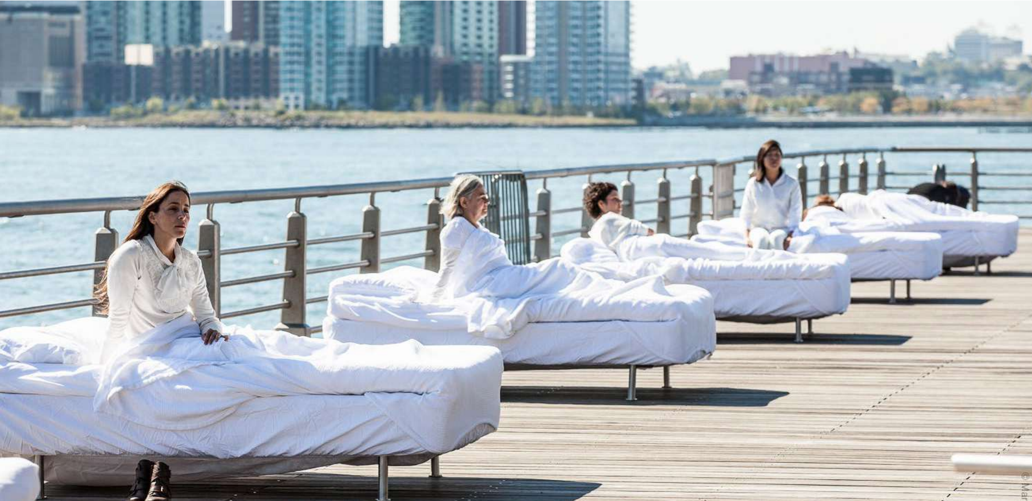
Crossing The Line Festival, New York, United States