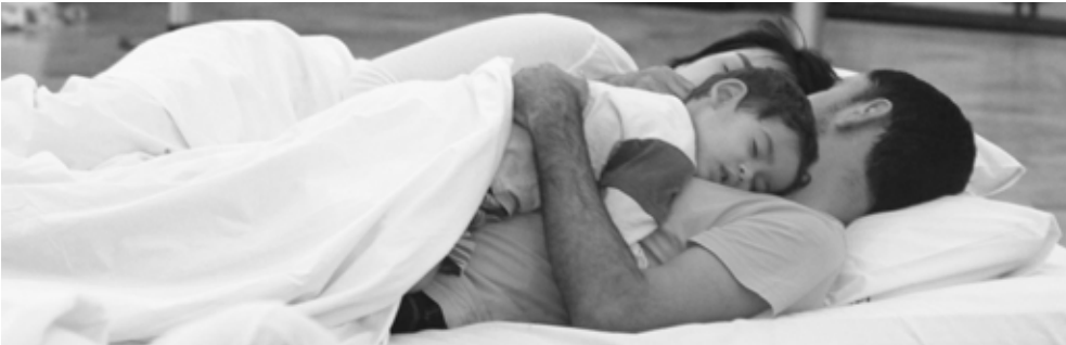
Festival Cena Brasil Internacional, Rio De Janeiro, Brasil